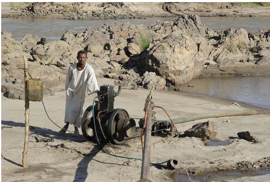
A Sudanese farmer operating an irrigation pump on Atram Island in Dar al-Manasir, North Sudan