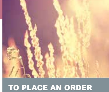
Go to: www.e-elgar.com Get up to 20% discount online